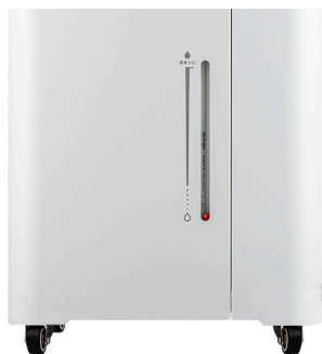
FLUID LEVEL GAUGE